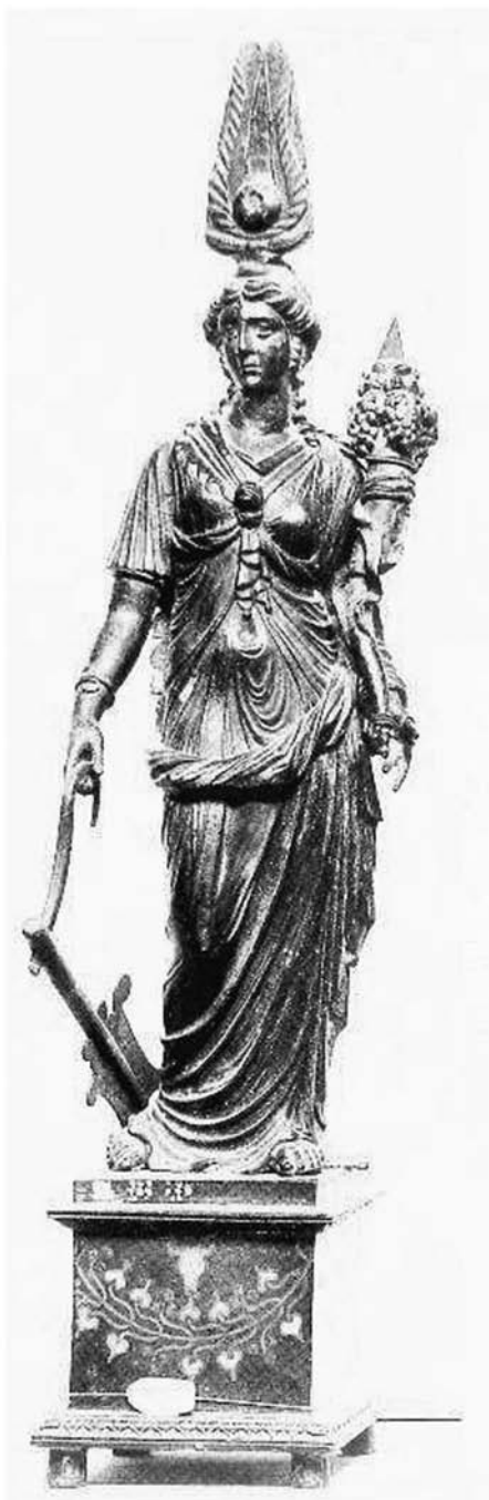
Fig. 3: Isis-Fortuna from Herculaneum