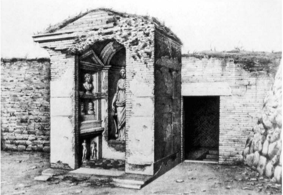
Fig. 1a: Aedicula of Isis-Fortuna at S. Martino ai Monti, reconstruction

their name or, at least, a substitute for it (e.g. Bona Dea ), the Christian god, like his Jewish precedent, was referred to simply as ‘god’ by his worshippers.