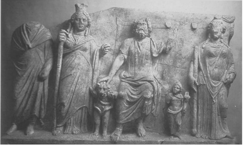
Fig. 5: Isis-Demeter on a relief found in Rome Via della Conciliazione

the find, the piece was manufactured in Alexandria. 435 Another representation of Isis–Demeter is found in a wall-painting discovered in a house under the Baths of Caracalla in 1867 (now in the Antiquarium of the Palatine). Unfortunately, the painting is in a poor condition. It appears that Isis is depicted wearing the basileion and holding a torch in her right hand, and perhaps ears of corn in her left. The painting may be dated approximately to the second half of the second century A.D. (fig. 6). 436