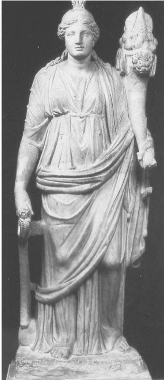
Fig. 1b: Statue of Isis-Fortuna from the aedicula at S. Martino ai Monti