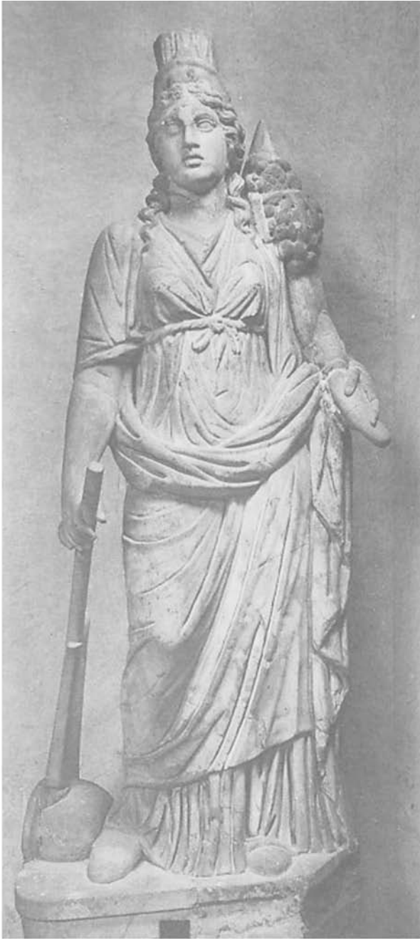
Fig. 4: Isis-Fortuna, marble statue from Rome, Vatican Museums